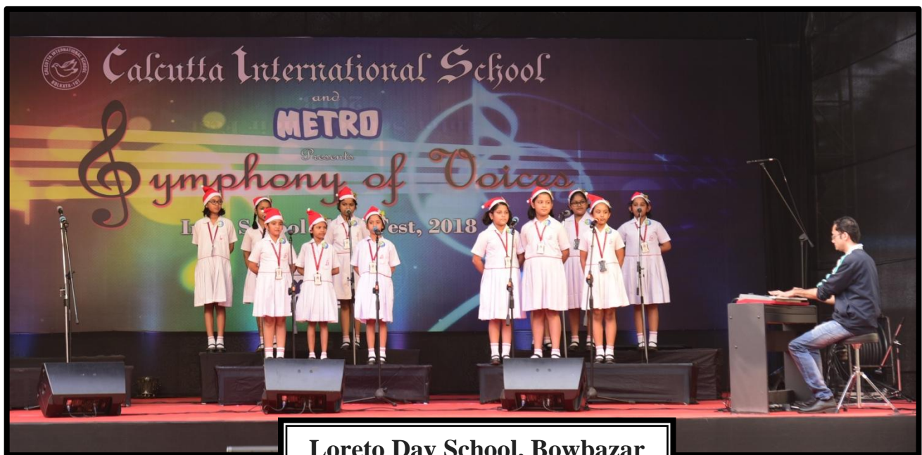
Loreto Day School, Bowbazar