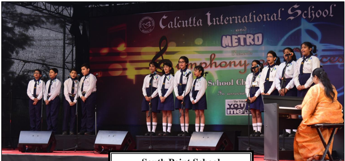
South Point School