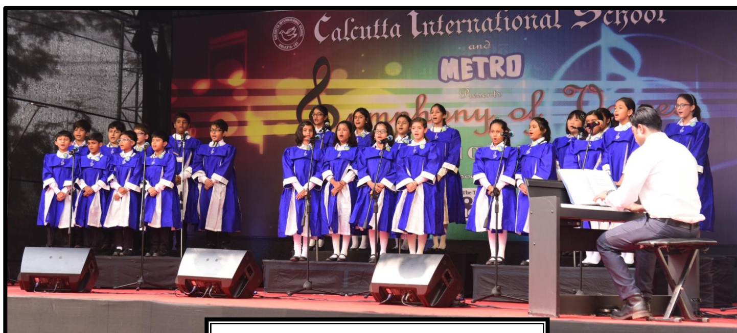
Calcutta International School