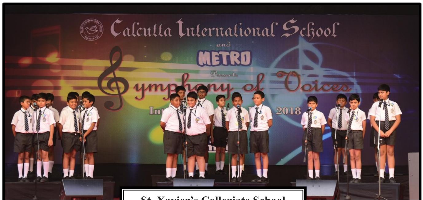
St. Xavier's Collegiate School