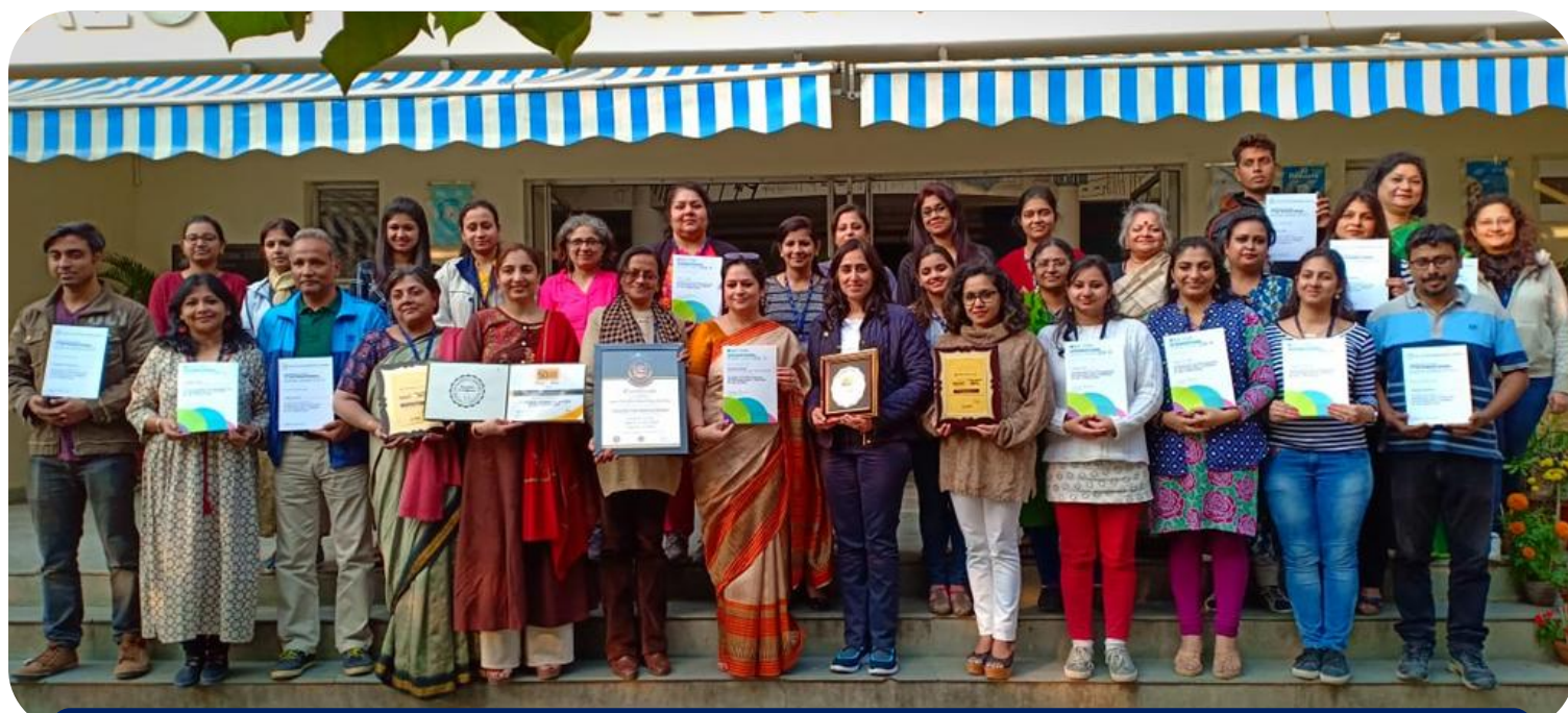
The ISA team with their certificates to acknowledge their contribution to the ISA project