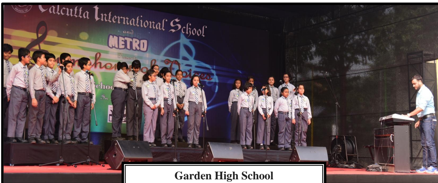
Garden High School