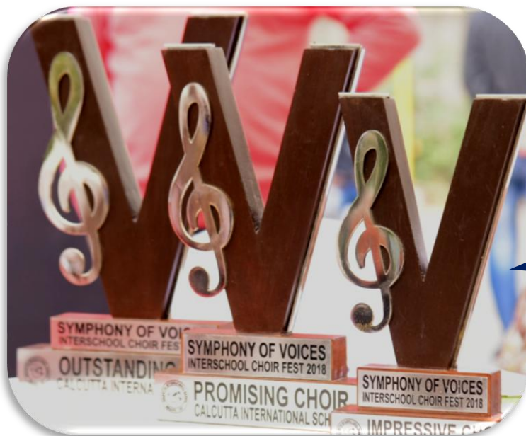
The Much Coveted Trophies