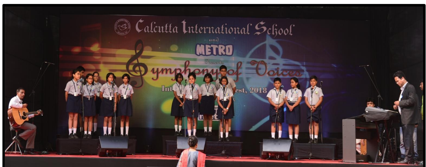
The Heritage School