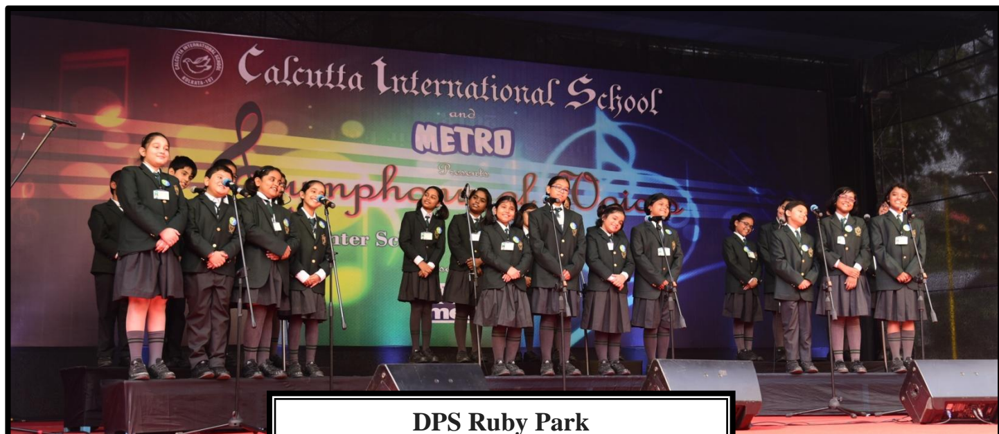
DPS Ruby Park